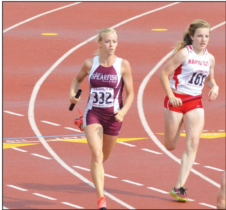
WATCH FOR THESE RETURNING TEAM MEMBERS & MORE